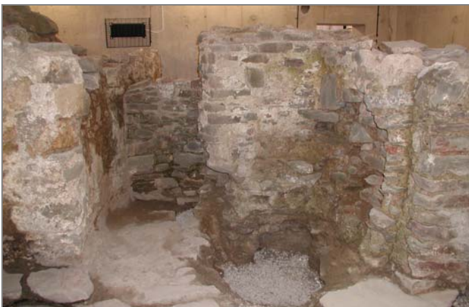
ARCHAEOLOGICAL EXCAVATION WITH STRUCTURE AROUND