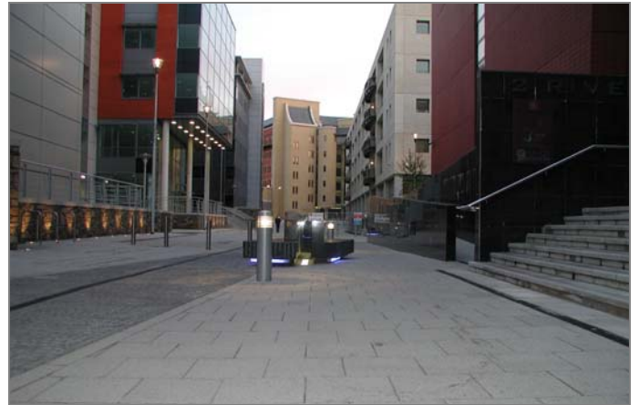
FINISHED HARD SURFACING