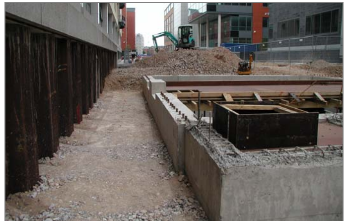
SHEETPILE RETAINING STRUCTURE AND GROUNDWORKS