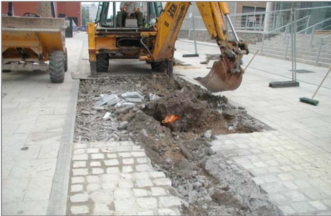
EXCAVATION TO INSTALL NEW DRAINAGE